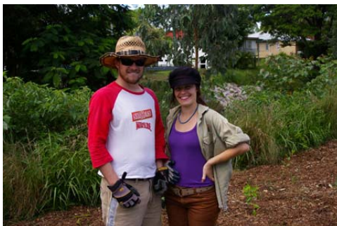
Middle Left: Local volunteers getting stuck in to work.