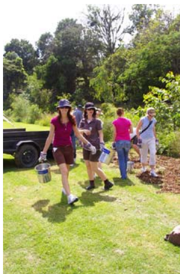
Middle Right: The team gets to work mulching newly planted trees along the creek.